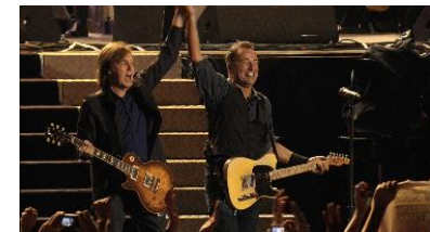
McCartney & Springsteen