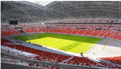
Singapore Sports Hub