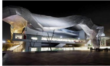
Milano Congress Center