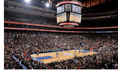
Philadelphia NBA Stadium