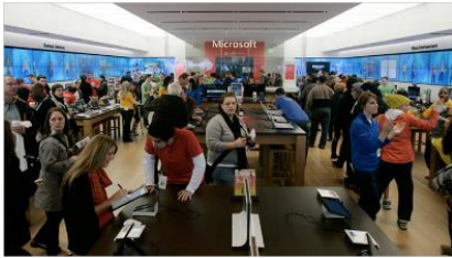
Microsoft Retail Stores